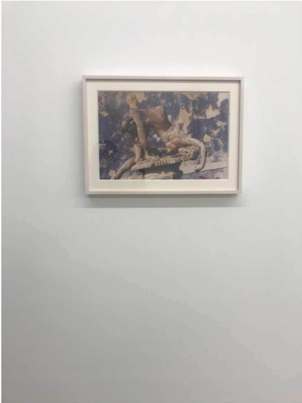
Installation view of The Conspiracy of Art: Part I

Simulacra & Simulation , perpetuates this performed art viewing experience. Such is The Conspiracy of Art , so aptly titled.