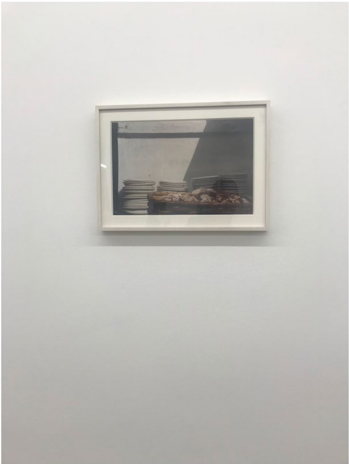
Installation view of The Conspiracy of Art: Part I

Jean Baudrillard's The Conspiracy of Art: Part I is on view at Chateau Shatto through May 25 th .