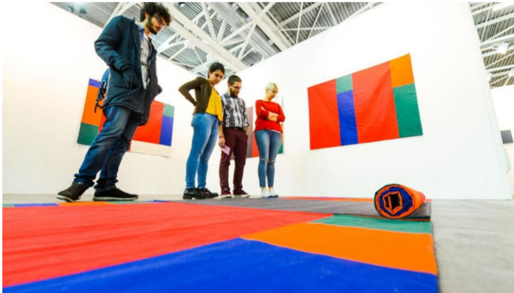
Live music is the title of the installation of Luca Frei to Barbara Wein gallery in Berlin, in the section "Present Future" dedicated to emerging artists

The contemporary exhibition opens today at the Oval in Turin: 193 galleries from around the world, many tissues, very neon, a few photos